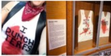
Degenderettes intimidation of feminists, lesbians, and women on display at marches and San Francisco Public Library (2018)